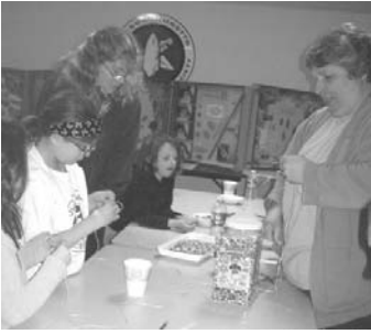
Bead Work in Progress