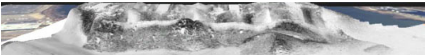
Bottom topography in causeway area