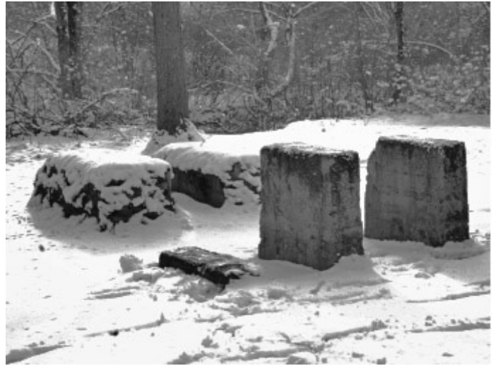
Concrete machinery bases at Felt Mill

for one of its bridge projects, MassDOT hired Archaeological and Historical Services, Inc. to prepare inventory forms for a potential historic district and an industrial site associated with water-powered enterprises dating as far back as the 1680s. A walkover survey noted the remnants of a stone dam across the river, channel walls along the river, stone walls that appeared to represent the remains of building foundations, and several concrete features that most likely were bases for machinery. All of these were probably associated with the site's last industrial use, a small factory that made felt from 1884 to 1920. Documentary research in the archives of the Millis Historical Society and the American Textile History Museum revealed a rich record of industrial enterprises at this location, including not only the felt mill, but also an early gristmill and sawmill, a scythe-making shop, a machine shop, a bonnet-wire factory, and a cotton