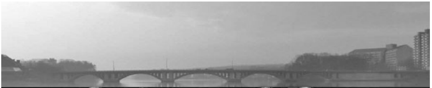
Kenneth F. Burns Memorial Bridge

erton-Eared Triangle projectile points, Brewerton-based drills, net weights, axes/choppers, and an ulu. A significant Transitional Archaic/Early Woodland component was also identified and included two steatite vessel lugs, Vinette I type pottery fragments, and three features (e.g., hearths and pits) that produced firm Early Woodland radiocarbon assays (cal B.P. 2740-2340). Evidence of Middle Woodland Period occupation within the site area included a large pit feature (cal B.P. 1180-1050).