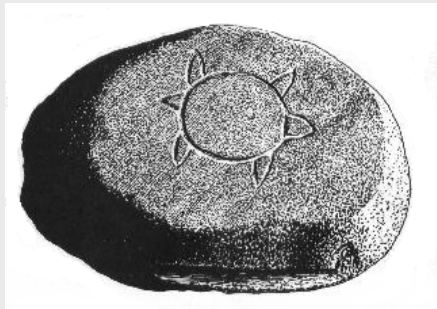
Pictograph with Turtle